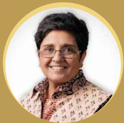
KIRAN BEDI IPS (Retd) Former Lieutenant Governor of Puducherry

POLICY MAKERS, GOVERNMENT & THOUGHT LEADERS