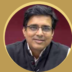
VINIT GOENKA Founder Secretary Centre for Knowledge Sovereignty & Member of Program Committee, Ministry of Culture Government of India, Former Member Governing Council & Centre for Railway Information Systems (CRIS) Former Member IT Task Force Ministry of Road Transport and Highway Government of India